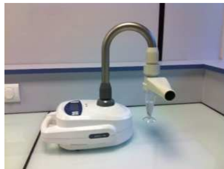
Coriolis \mu equipped with the air intake with 25mm connection

Internal diameter: 25mm (0.98In) External diameter: 30mm (1.18In) Length : 170mm (6.69In) Weight : 190grams (0.42lbs) Autoclavable at 121°C for 15min