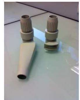
Left : Air intake with 25mm connection Right : Air intake